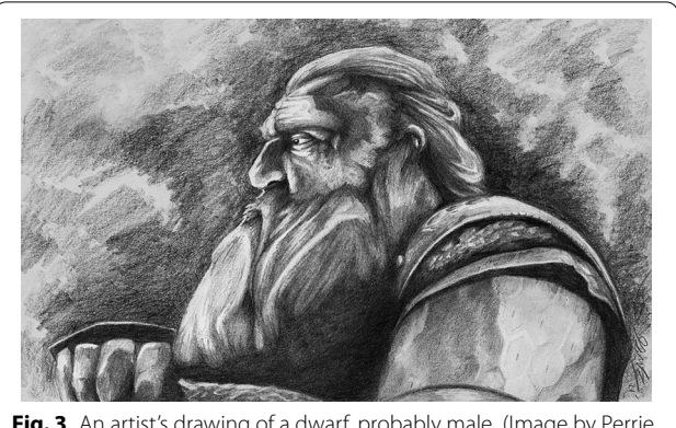
Fig. 3 An artist's drawing of a dwarf, probably male

One common feature of fast life history organisms is that they tend to disperse widely, like weeds that persist by quickly colonizing new disturbances in the environment. Small body size and low investment in their bodies might render orcs at a disadvantage when directly competing with other hominids of Middle-Earth, which is supported by the fact that they lost most of the documented wars with the other hominids over the ages. So instead of directly competing, there would have been selection on orcs to tend to migrate in order to find environments where they could thrive without direct contact with humans, elves or dwarves.