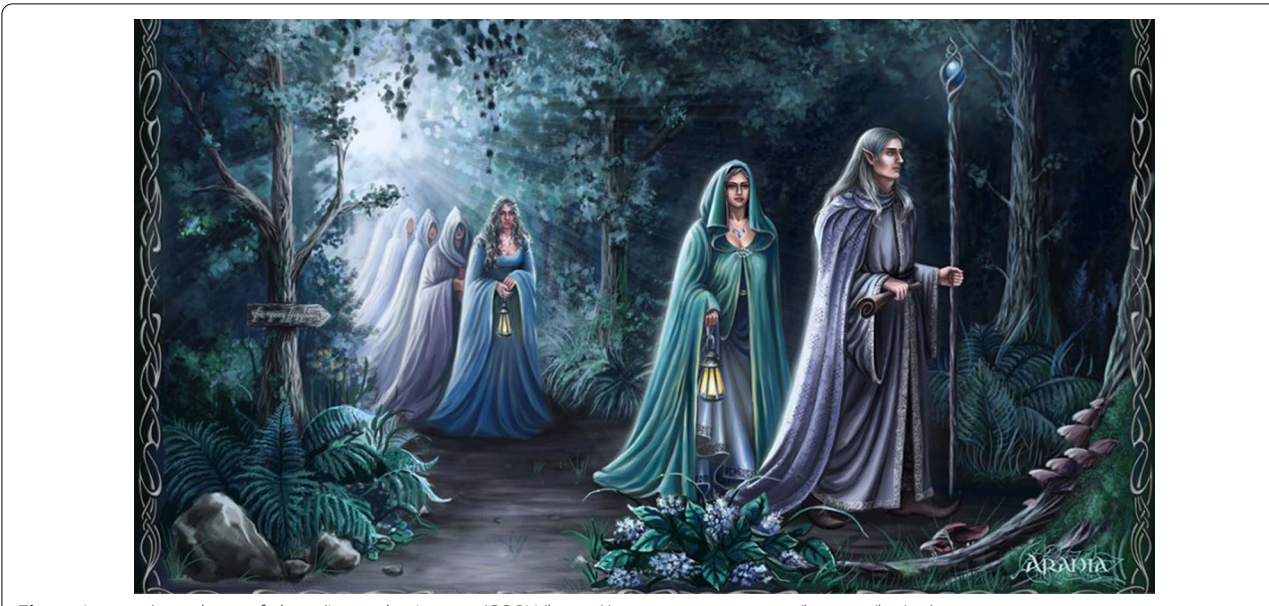
Fig. 1 An artist's rendition of elves (Image by Araniart/CC BY (https://creativecommons.org/licenses/by/3.0)

elves exhibiting the slowest life history strategy known in mammals. It may only be rivaled by some trees on Earth, such as bristlecone pine trees, that can live thousands of years (Lanner and Connor 2001).