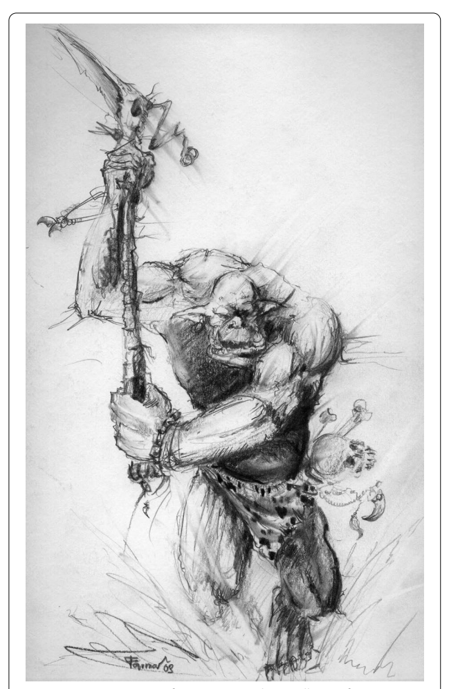
Fig. 2 An artist's image of an orc. Given the small size of most orcs, the skull on its belt probably belonged to another orc or a hobbit. Alternatively, this might be a reproduction of an Uruk-hai, one of the larger orcs (Image by farmerownia (www.farmerownia.pl) (BY-SA ())

multiple mates. This is supported by Tolkien's observation that they are highly monogamous (Tolkien 2010a).