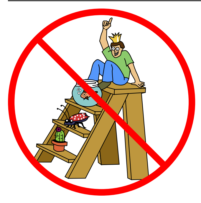
Fig. 1 Evolution is not goal directed and does not climb a ladder of progress. An organism's fitness is not absolute but is dependent on its current environment. Illustration modified with permission from the Understanding Evolution website