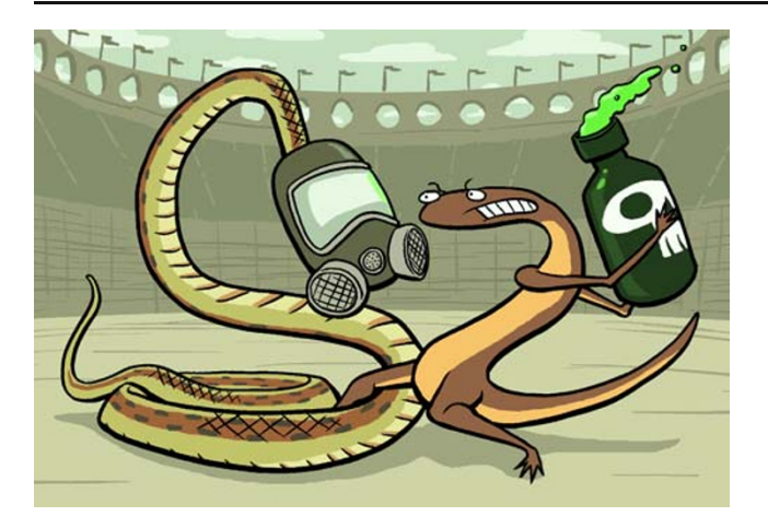
Fig. 2 The rough-skinned newt and the common garter snake are engaged in an evolutionary arms race. Illustration reproduced with permission from the Understanding Evolution website

traits vary among individuals in a population, are genetically based, and affect fitness (Brodie 1968; Brodie and Brodie 1990, 1999a; Hanifin et al. 1999; Williams et al. 2003). Then they showed that newt and snake toxicity varies across different regions but that newts and snakes living in the same region have matching levels of toxicity and resistance (Fig. 3), exactly as we would expect if newts and snakes are engaged in an evolutionary arms race that has escalated more quickly in some regions than others (Brodie et al. 2002). The researchers even figured out exactly what trade-off is at stake for the garter snakes: speed. Garter snakes with low resistance are quick—which helps them escape their predators and catch prey-and the more toxin resistance a garter snake has, the slower it moves (Brodie and Brodie 1999b). Too much resistance makes the snake pay a significant price—trouble catching food and escaping from its own predators. This compelling example provides an opportunity to help students learn important evolutionary and ecological concepts while gaining an understanding of the process of science and how biologists investigate questions about the evolutionary past using evidence they gather today (see "In the Classroom" section below for teaching resources on this example).